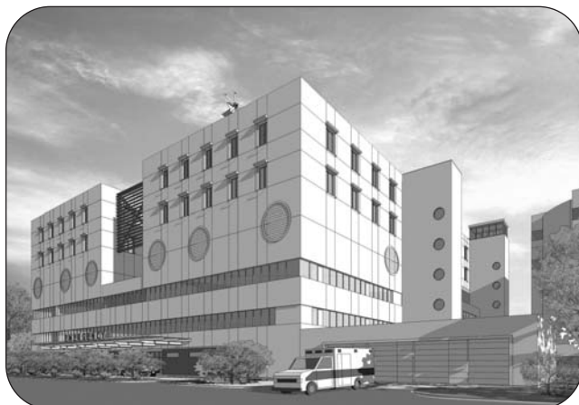
Kelowna General Hospital Patient Care Tower Ambulance Entrance

The project was originally announced in the spring of 2007 of a capital value of $200.1 million. In September 2007, the capital value was revised to $251.1 million. As a result of the changes described above, the final total capital cost has increased by $181.8 million.