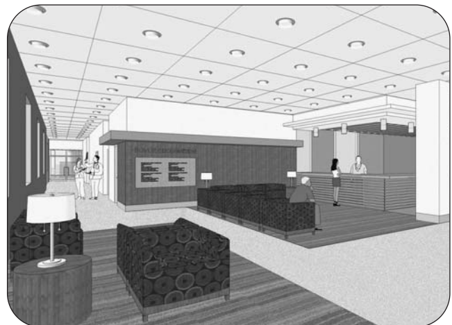
Vernon Jubilee Hospital Patient Care Tower Interior

Once construction is complete and occupancy permits are in place, IHA is responsible for paying Infusion Health annual service payments for 30 years. IHA is responsible for making monthly payments to Infusion Health based on performance, facility availability and service quality. Infusion Health’s performance will be continuously monitored throughout the operating period based on key performance indicators, and IHA may make deductions from the monthly payments if Project Agreement standards are not met.