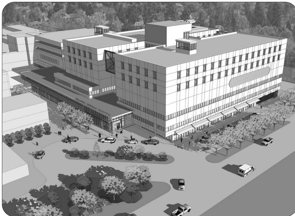
Kelowna General Hospital Patient Care Tower