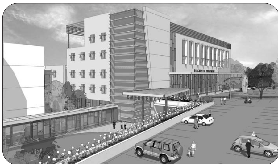
Vernon Jubilee Hospital Patient Care Tower Emergency Entrance

As a centre of PPP procurement expertise, Partnerships BC continues to develop best practices. Partnerships BC continually transfers knowledge and experience gained from past projects to others, to improve efficiency and quality, and to streamline and expedite the procurement process to save time and money for the public sector. Partnerships BC is represented on the steering committees for all PPP projects to ensure the application of sound governance principles and best practices. For example, the use of certain procurement documents across health care projects, including the KVH project, has resulted in the reduction of certain procurement-related costs. Procurement expertise is shared with ongoing knowledge transfer between projects in the various sectors.